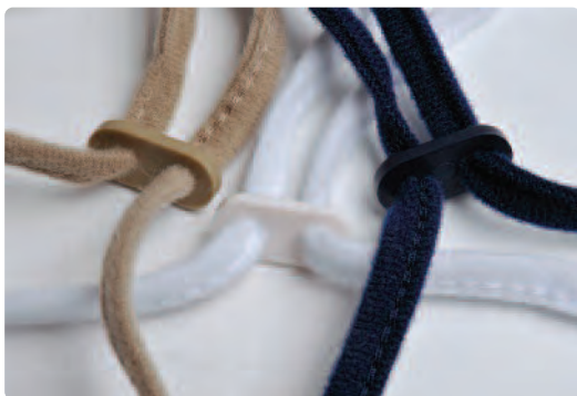
Buchanan® Lite - with Ezi-Tie® adjusters for increased comfort