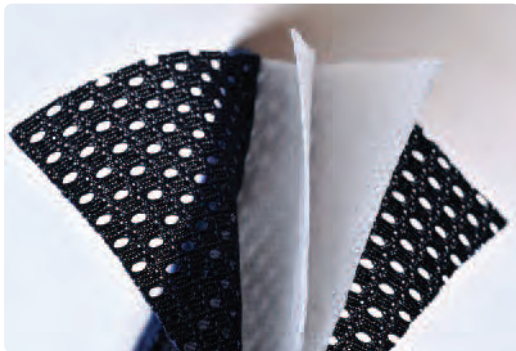
The unique layered lightweight construction.