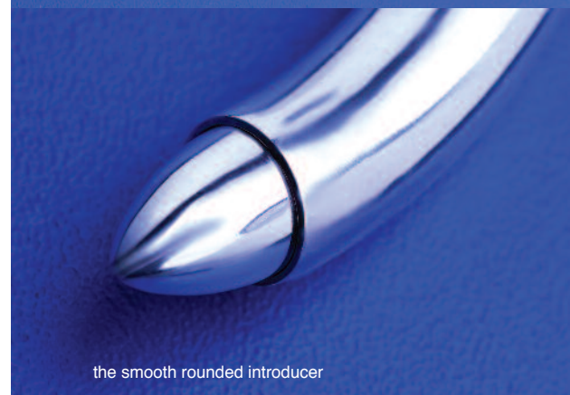
the smooth rounded introducer